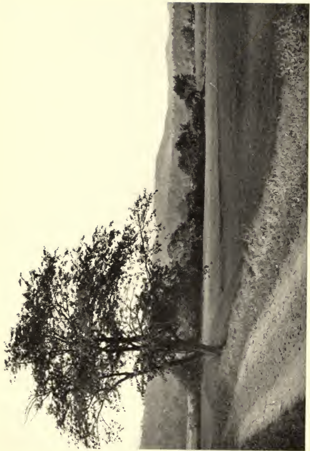
DEERFIELD NORTH MEADOWS